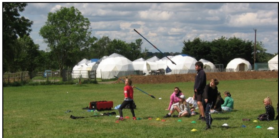
Right: mini-Olympics—javelin throwing