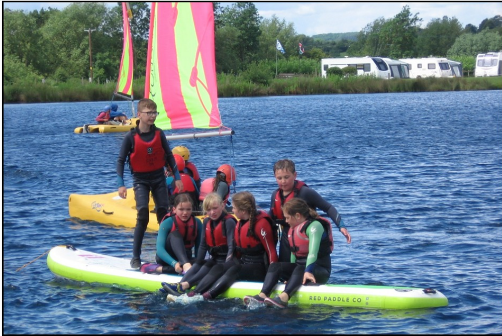
Team Challenge on the lake— trying to balance on the paddle board