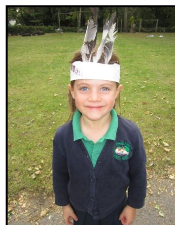
Above: Florence with a feather headdress

The club runs each day until 5.30pm and costs £6 a session. If you think your child would be interested, contact Gemma in the office.