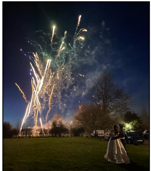
Right: the couple and guests enjoy a magnificent fireworks display