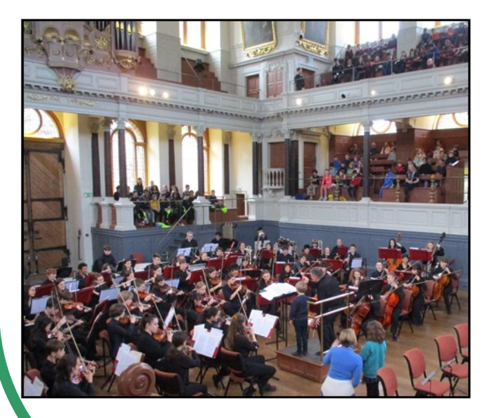
The Oxfordshire County Youth Orchestra tune up