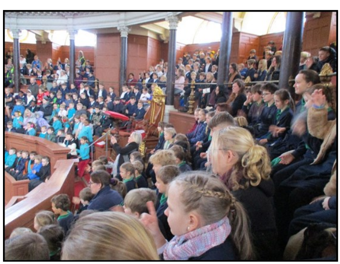
A wonderful opportunity for our children