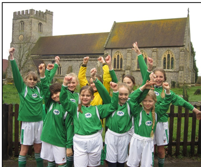
The A-Team celebrates!