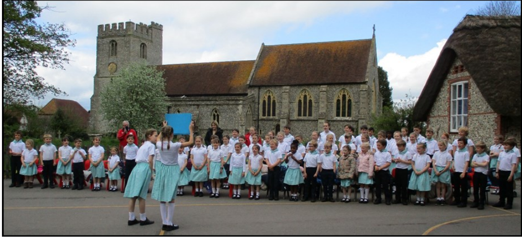
The whole school start off the proceedings with a new Maypole song