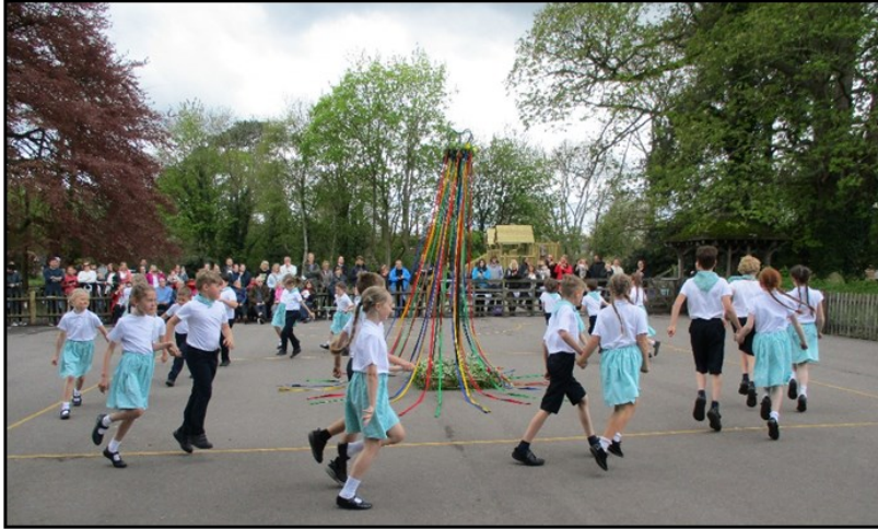
Above: the Lower Juniors.