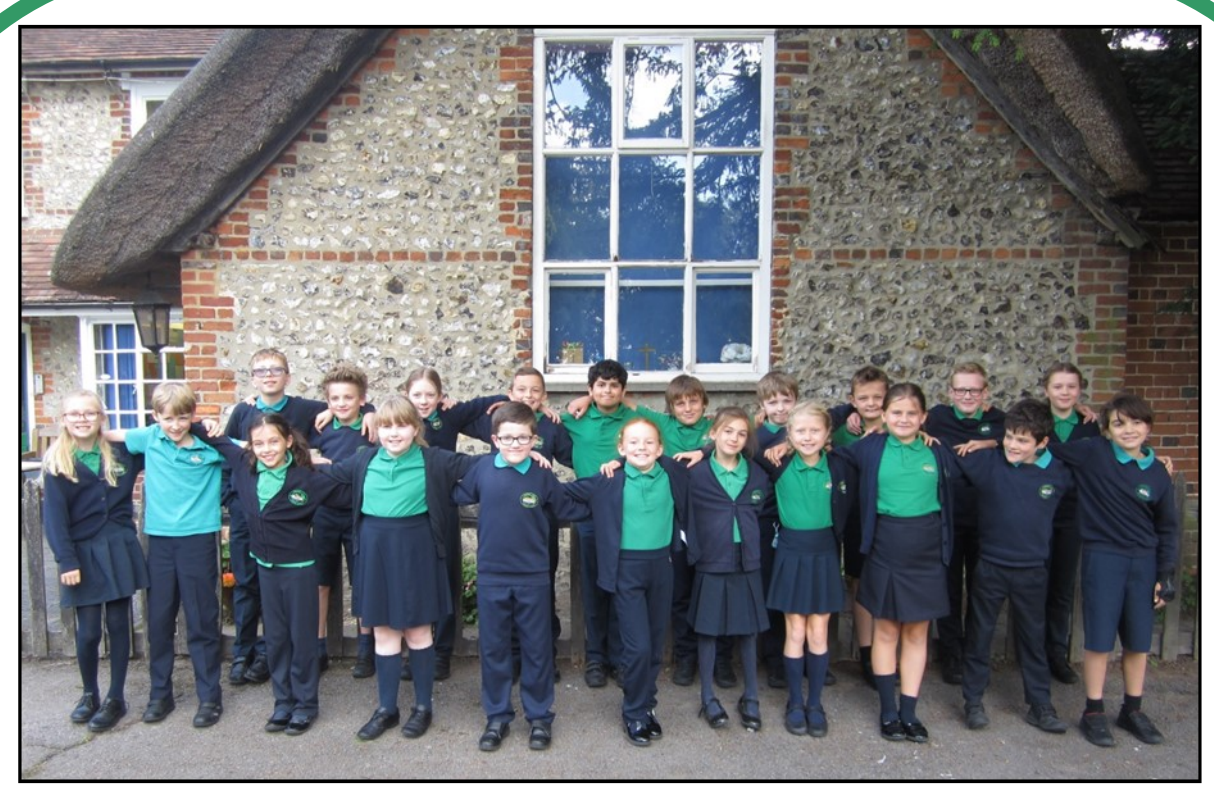
Above: The Upper Juniors. Years 5 and 6

It's lovely to have all our children back at school and they settled in quickly without any fuss. The teachers have been assessing the children and we already have catch-up programmes in place because even though the children had access to online learning during lockdown, it's just not the same as being in the classroom with their teacher and friends.