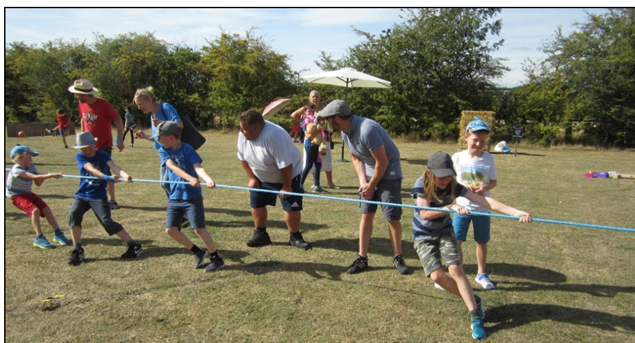
Above and left: Pull...Lewknor Primary children take part in the tug-of-war