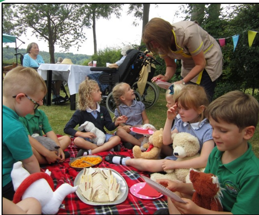
Left: The children enjoy lots of treats during the picnic