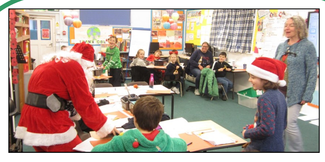
Left: Ho! Ho! Ho! The Upper Juniors class