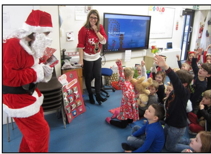
Above: The Infants class