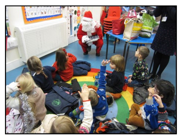
Above: The Reception class