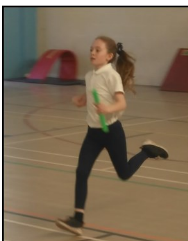
Above: electric Eva