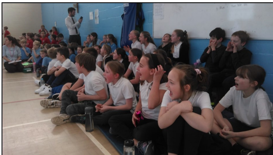
Above: the children cheer on their school team