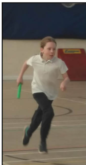
Above: speedy Stanley