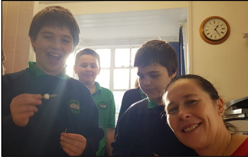
Making the Christingles—mums on hand to help!