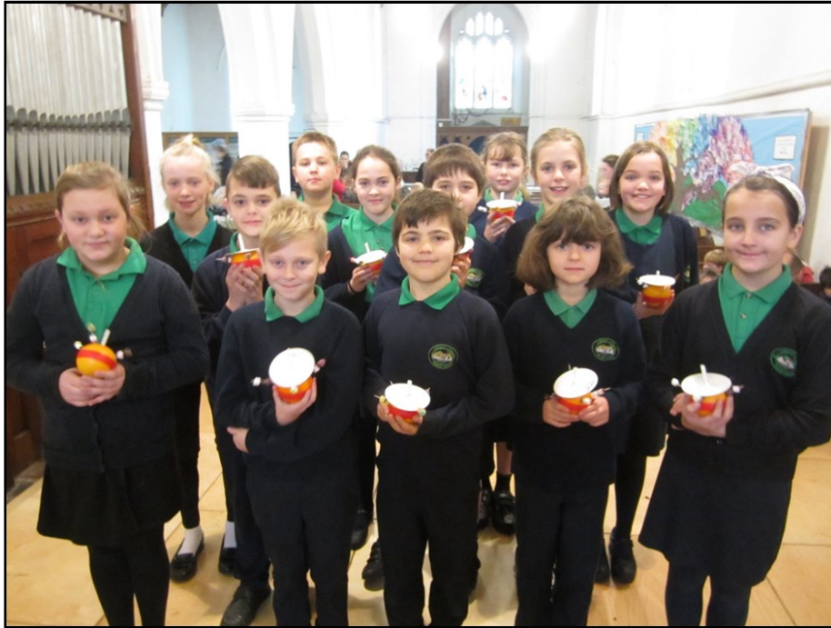
Their last Christingle service at Lewknor Primary—the Year 6 children.