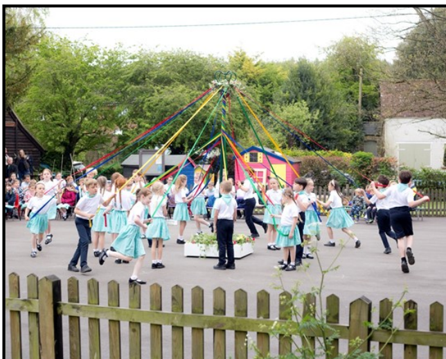
The Lower Juniors —Years 3 and 4