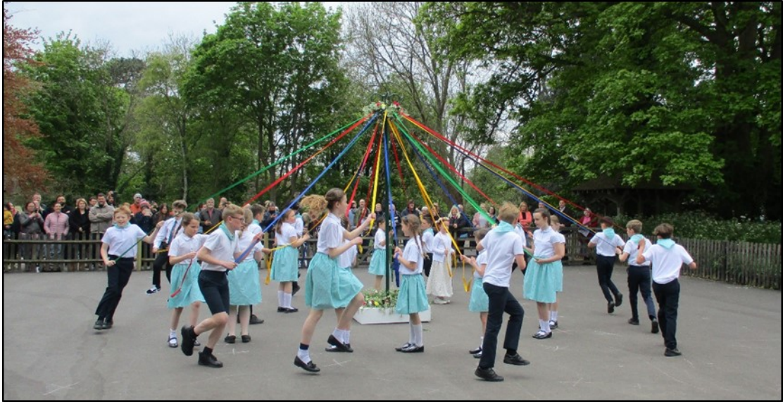
The Upper Juniors—Years 5 and 6