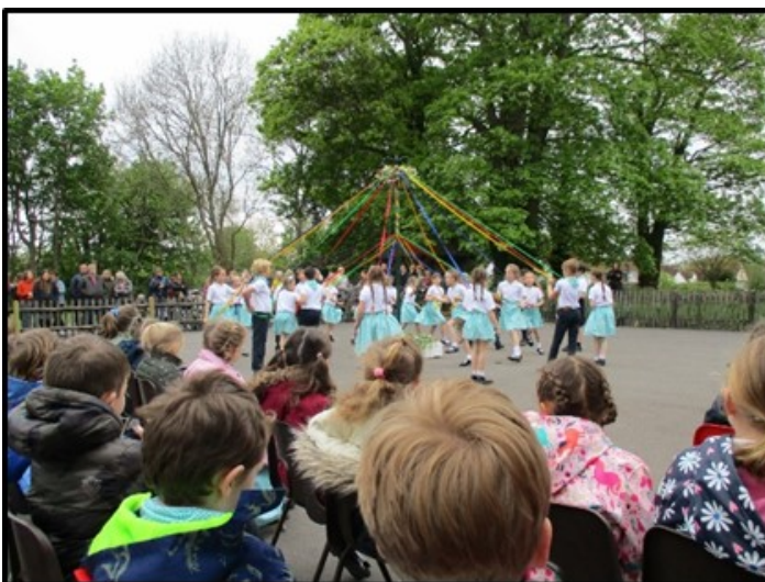
The children watch the Lower Juniors dance