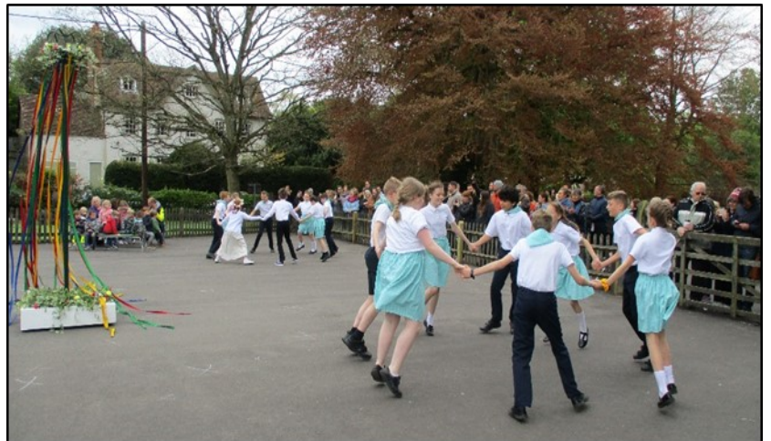
The Upper Juniors dance a lively reel called The Hollins Bus