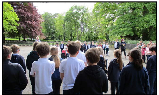
Right: the Upper Juniors in the foreground