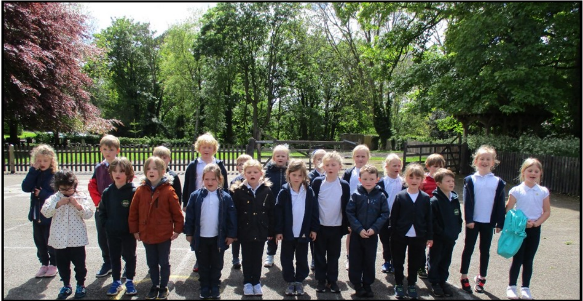
Above: the Infants take part in the singing