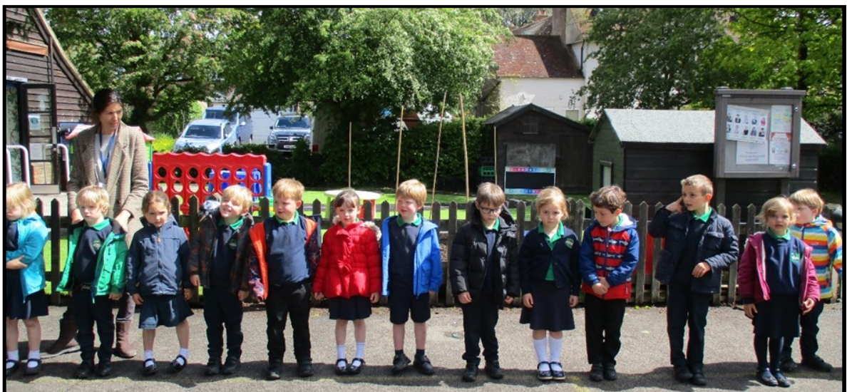
Below: The Reception class