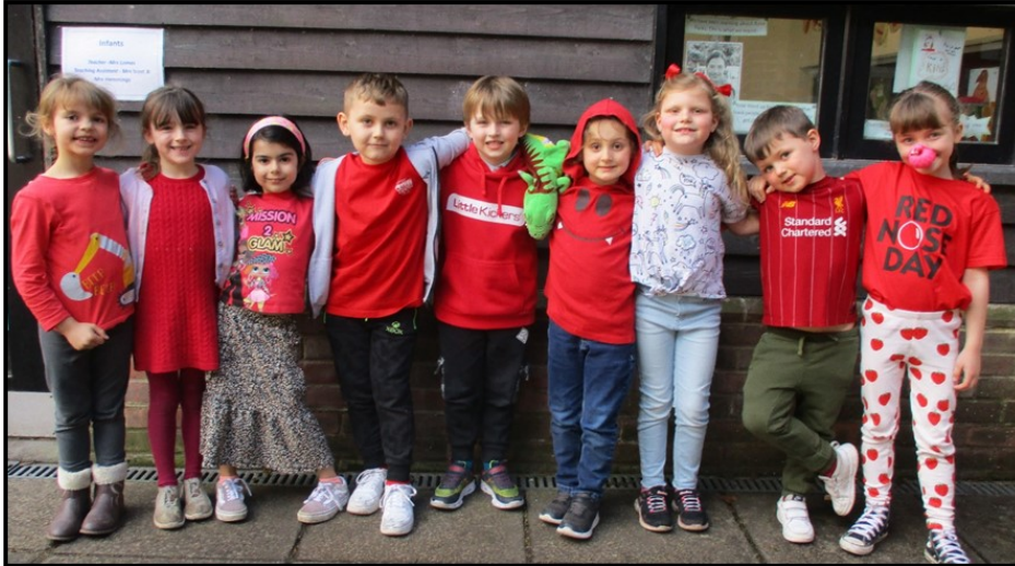
Above: some of the children in the Infants class