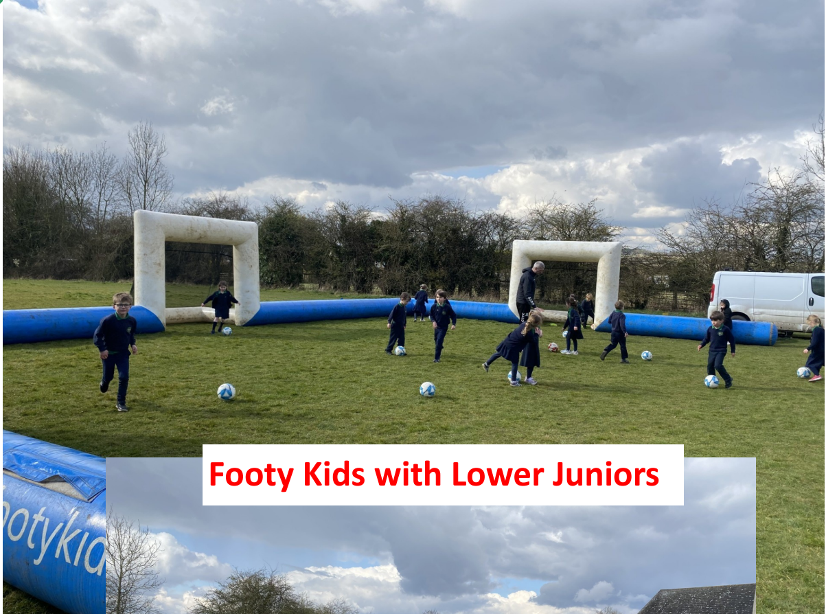
Footy Kids with Lower Juniors