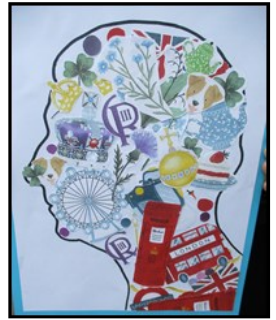
Some examples of the children's artwork pictured left and below