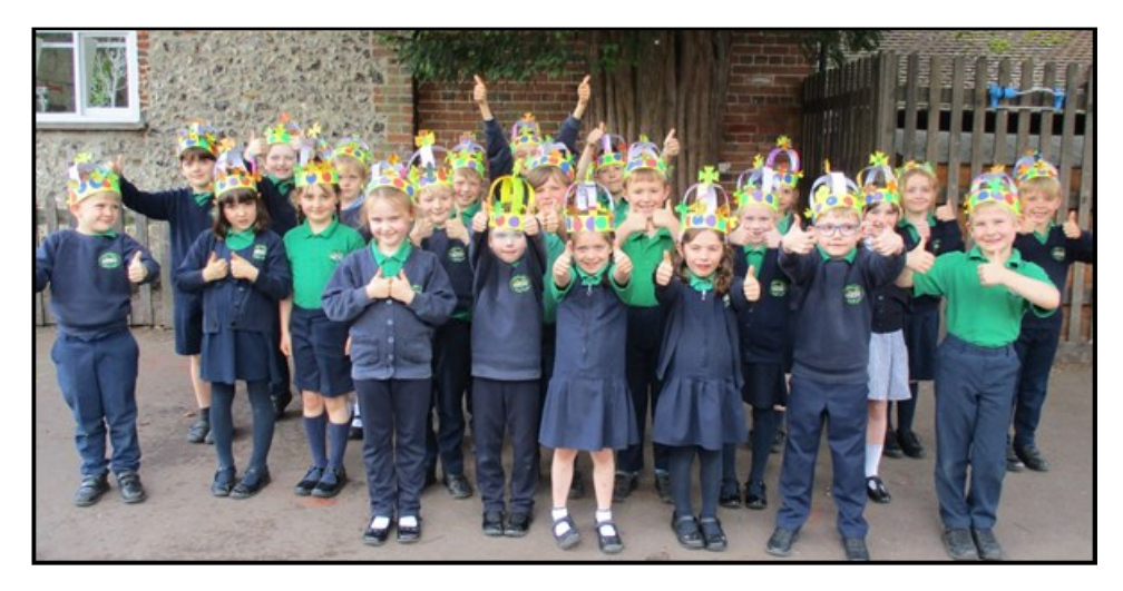
The Infants (Years 1 and 2) give the thumbs up to their coronation crowns

The children had fun learning all about King Charles III's coronation on the Friday before the actual ceremony. All the children at school completed a range of art and design activities to celebrate the occasion. The children in the Reception and the Infants classes made crowns, while children in the Lower Juniors (Years 3 and 4) cut out pictures of typical British icons, for example, Big Ben, the Union Flag, red telephone boxes and the London Eye, and arranged these inside a profile outline of King Charles III's head (see photos on next page).