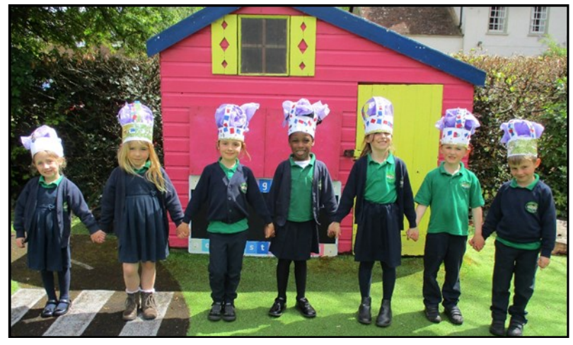
Some children from the Reception class wearing their coronation crowns

The children had fun learning all about King Charles III's coronation on the Friday before the actual ceremony. All the children at school completed a range of art and design activities to celebrate the occasion. The children in the Reception and the Infants classes made crowns, while children in the Lower Juniors (Years 3 and 4) cut out pictures of typical British icons, for example, Big Ben, the Union Flag, red telephone boxes and the London Eye, and arranged these inside a profile outline of King Charles III's head (see photos on next page).