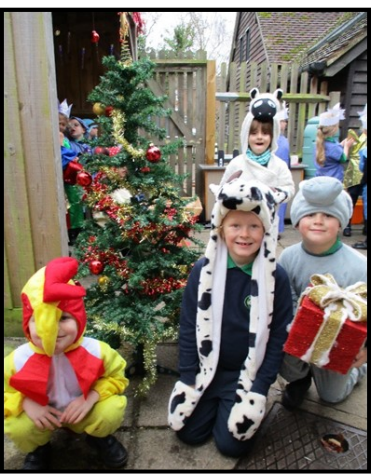
Above stable animals Wyatt (hen), Charlie (cow), Archie (pig) and Ned (sheep)