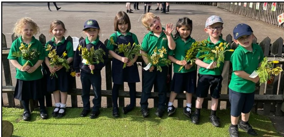
The Reception Class