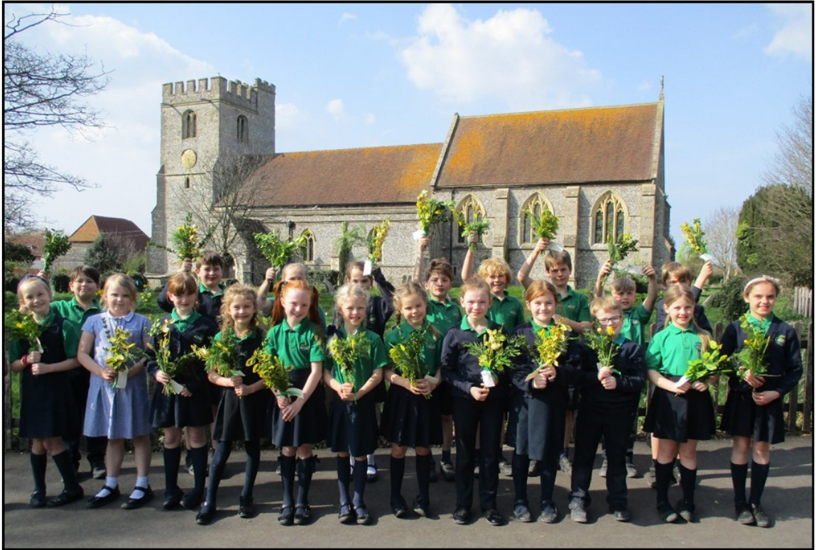
The Lower Juniors (Years 3 and 4)