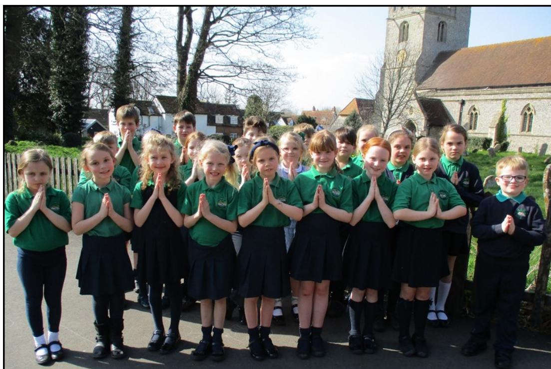
Perfect angels — the Lower Juniors put their hands together for prayer during the assembly practice