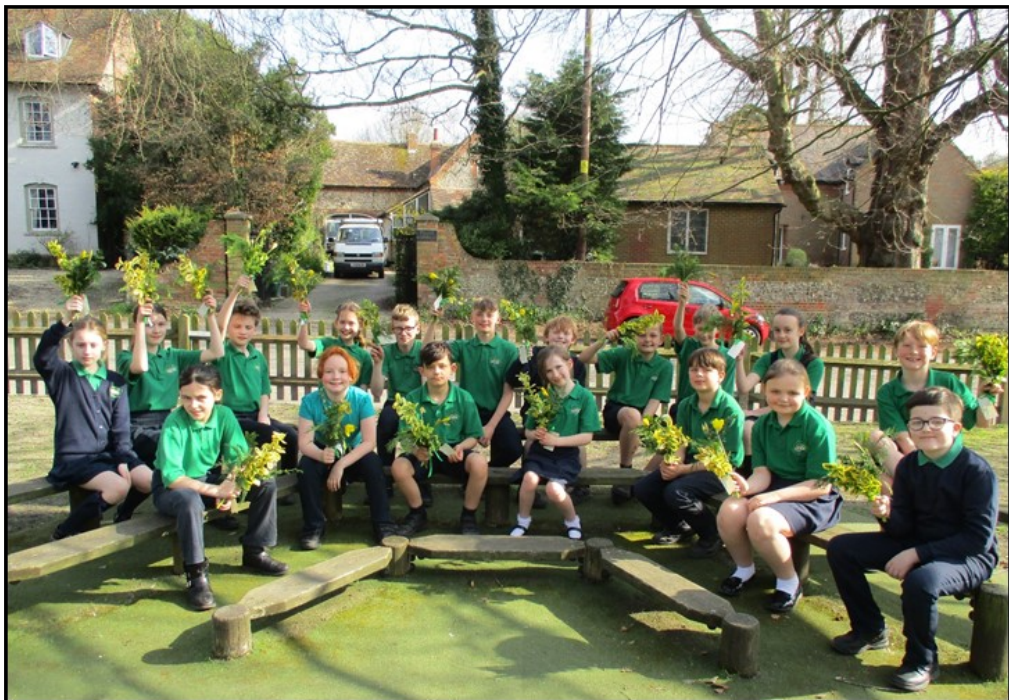
The Upper Juniors (Years 5 and 6)