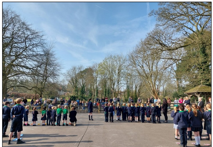
View from the back. Children stand in class bubbles in the playground while the parents watch the assembly behind the fence. It was a fantastic turn out. Thank you to all the parents who attended — your support means so much to the children and the staff.