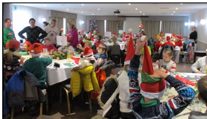
Right: the children tuck in