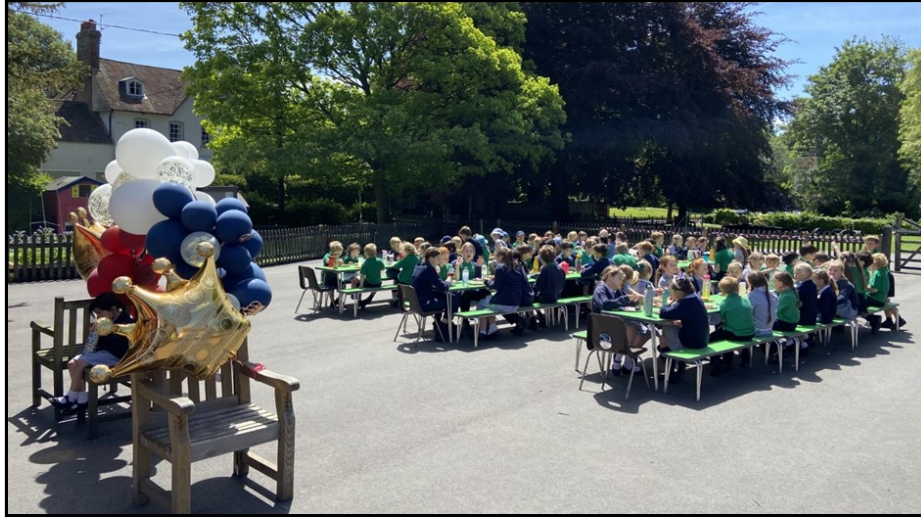
Left: Whole school playground party