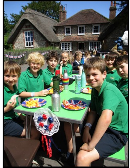
Left and right: Upper and Lower Juniors enjoy the party lunch