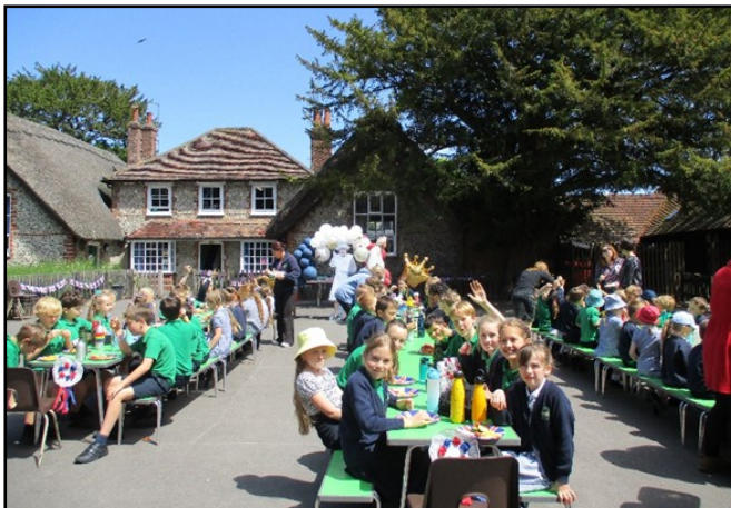
Children tuck in