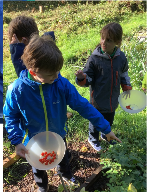
Picking at the allotment.