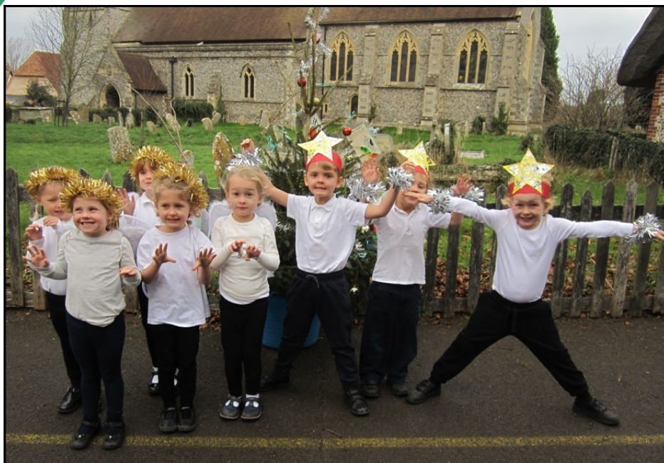
Little stars—the reception class