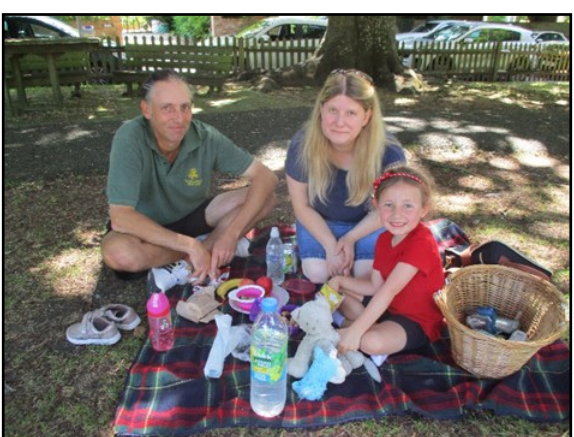
Mollie with mummy and daddy