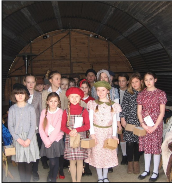
Above: The girls look lovely in their World War Two costumes

Marie wrote: "When we stepped off the coach I felt not only the sun blazing on the back of my neck but the other schools eyes on us because we were all dressed up as evacuees from World War Two.