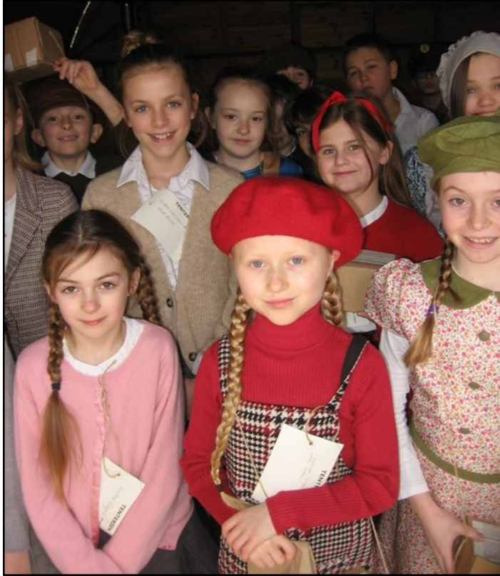
Class trip, March 2020