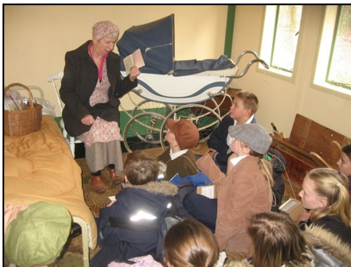
Left: the children learn about life during wartime including rationing and ration books