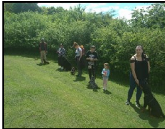
Left: the dogs and owners line up to be judged. There were six categories: best male, best female, best veteran 7+, best puppy under 18 months, best young handler under 12-years-old, best trick. There were also prizes for best in show and reserve best in show.