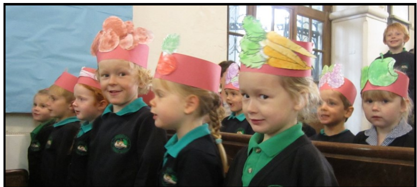
Above: The reception children's first whole school performance

During the service the children showed how the word 'Harvest' can be broken up into smaller words such as: eat, have, starve and share. They talked about the foods they liked to eat, and how they wanted to thank those who work hard to produce our food - those who grow the crops, prepare the food and transport the food to our towns.