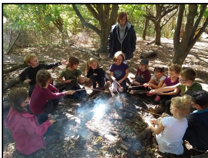
Left: Campfire's burning.