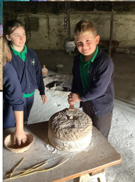
Lower Juniors trip to the Chiltern Open Air Museum