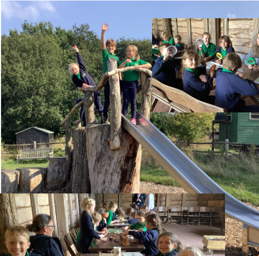
Lower Juniors trip to the Chiltern Open Air Museum