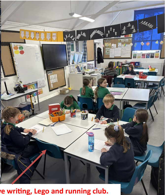
Gardening, Creative writing, Lego and running club.