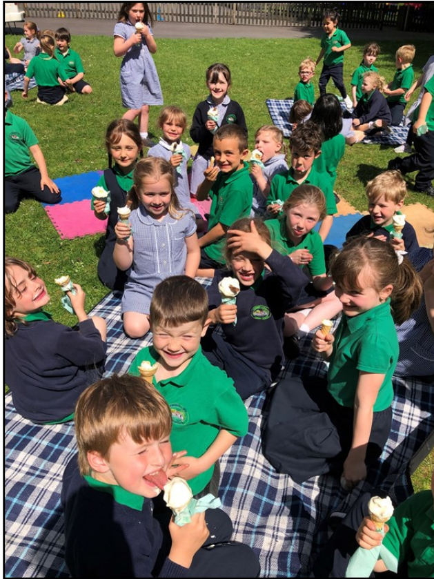
Left: The Infants!