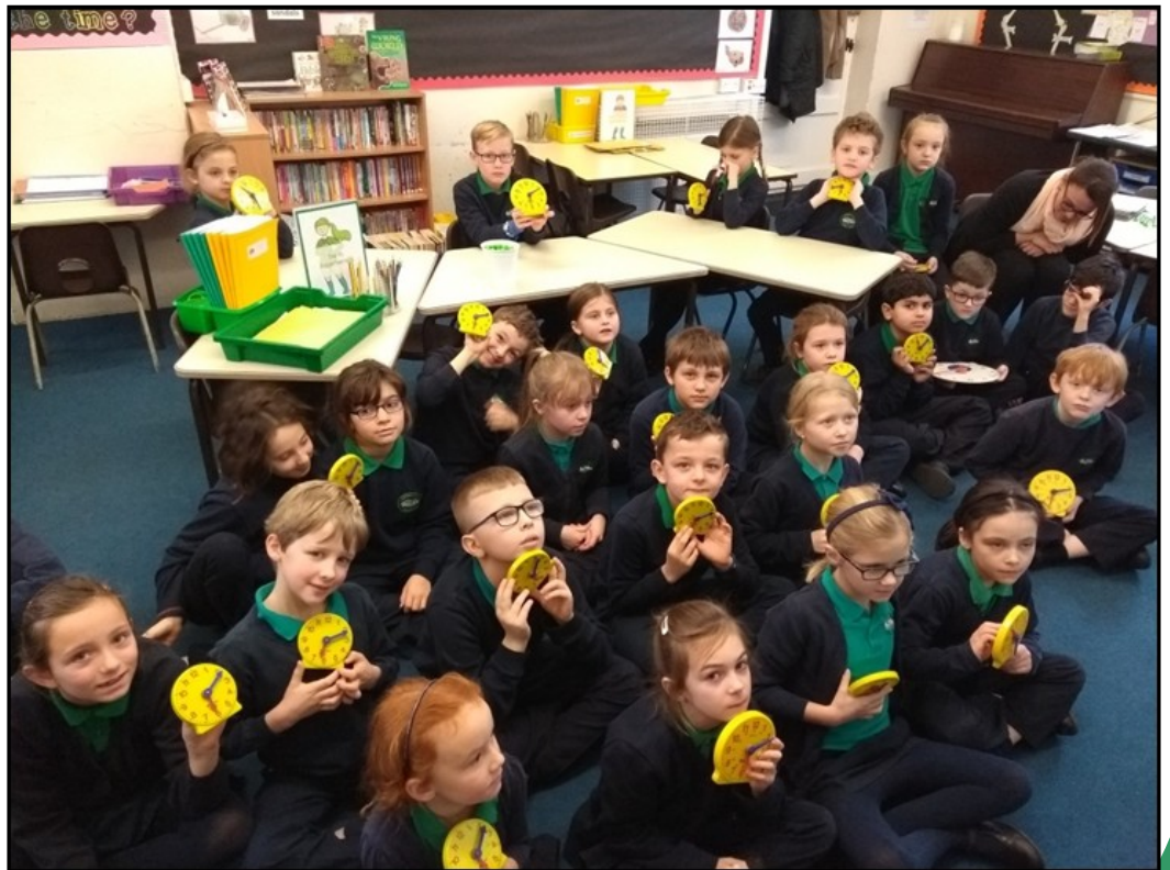
Above: Lower Juniors make fast time learning the clock

It reminds me of a joke. What does a clock do when it's hungry? It goes back four seconds! (Geddit?)