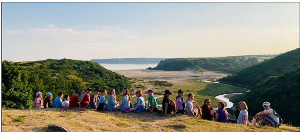
The Upper Juniors (class of 2022) enjoy the view during an evening walk

The children will get the chance to take part in a range of activities that might include caving, abseiling, canoeing, rock climbing and much more.