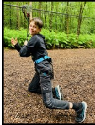
Left: Phew, he quickly recovers!