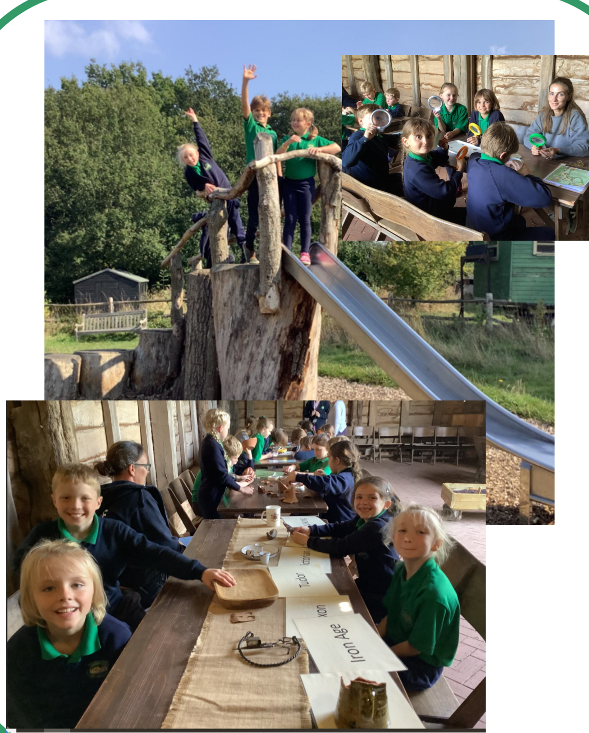
Lower Juniors trip to the Chiltern Open Air Museum