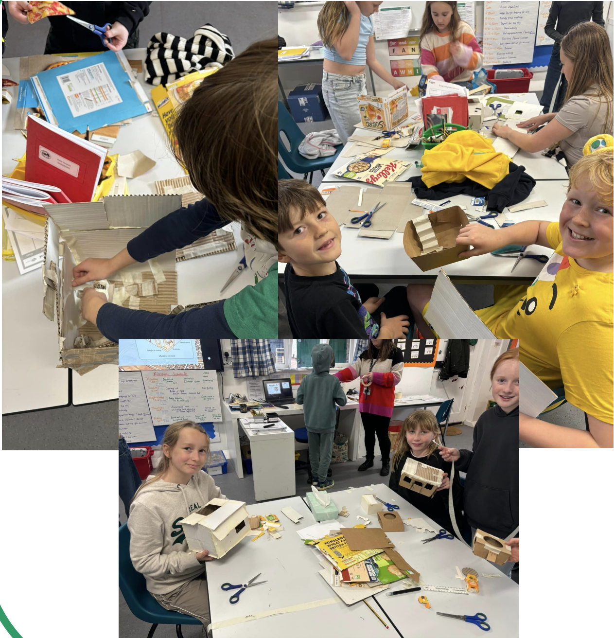
Upper Juniors making Ancient Sumerian houses...