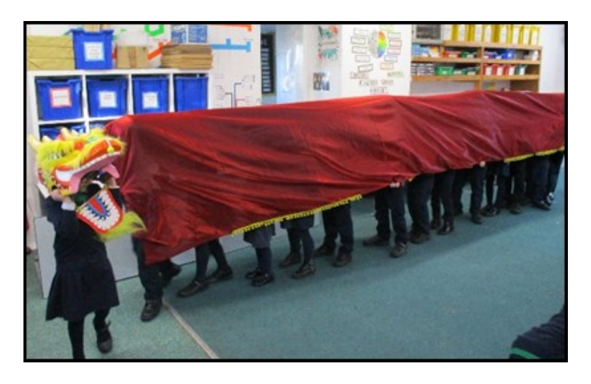
The Lower Juniors have a turn