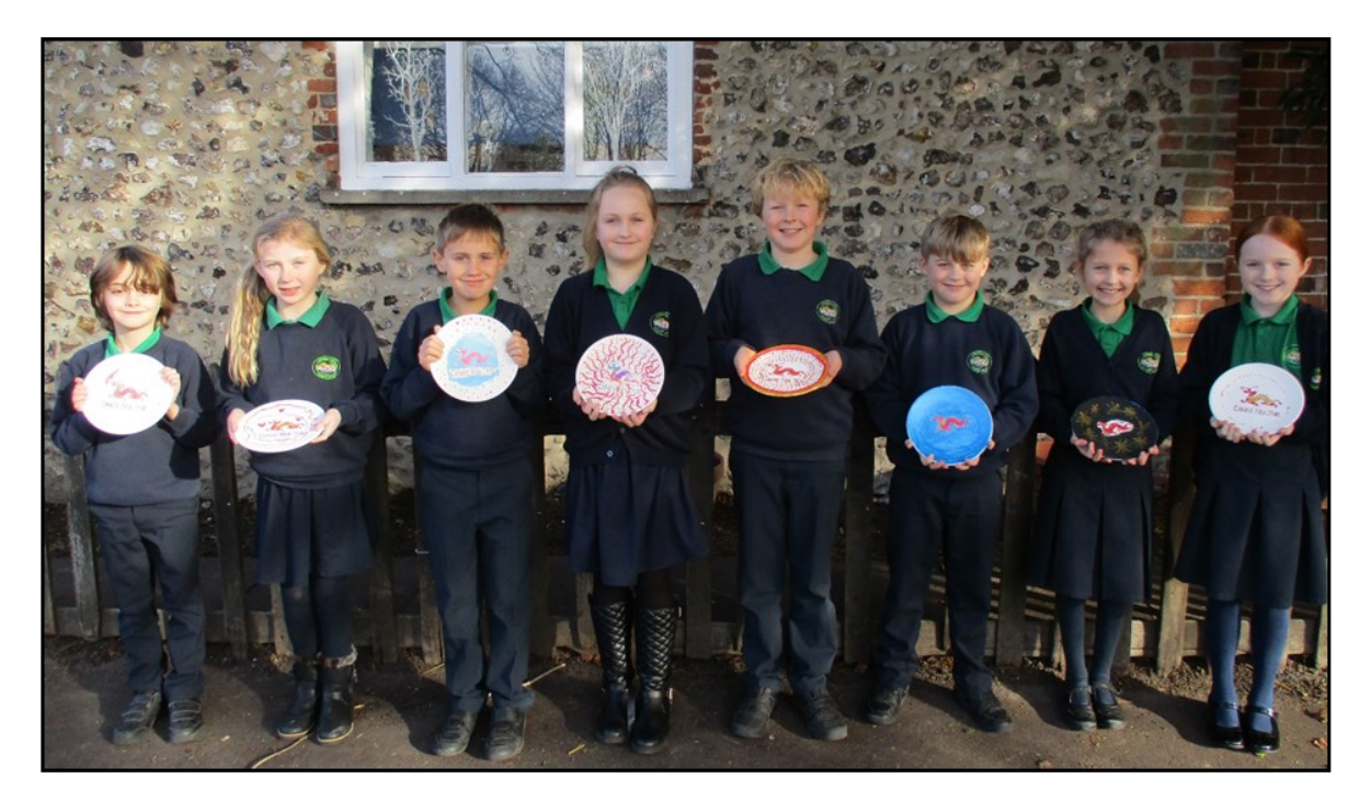
The Lower Juniors with their beautifully painted Chinese new year clay plates