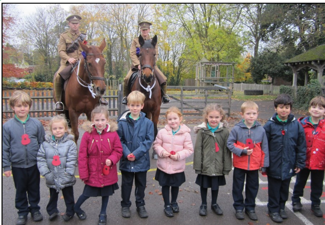
Lewknor children and the Chinnor war horses