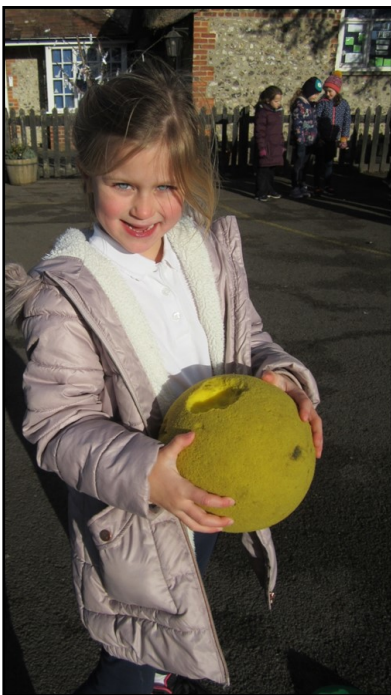
Left: Poppy tries to get the children out!