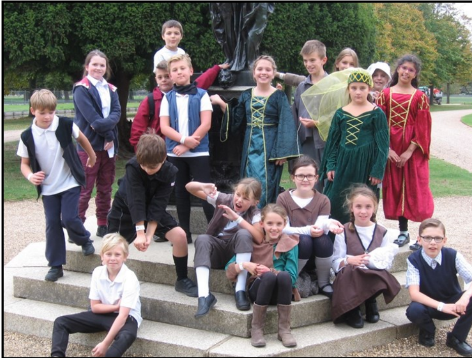
The Upper Juniors in their Tudor finery