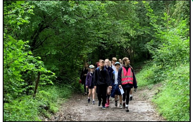
Above and left: the Upper Juniors