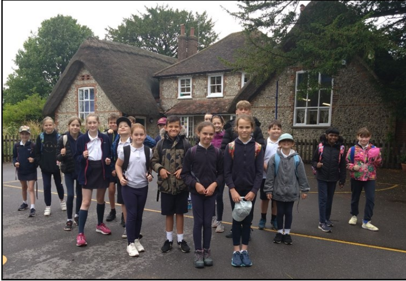
The Upper Juniors—Years 5 and 6