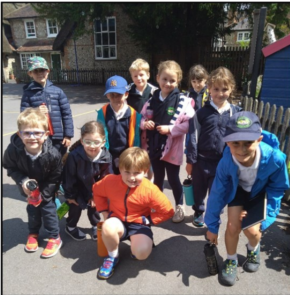
Left: some of the Infants.