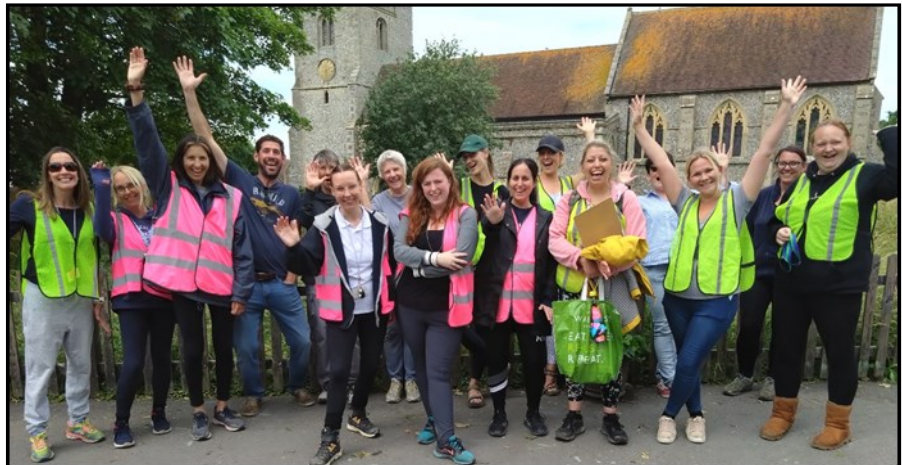
Our dream team—parent organisers and staff

Thank you to Friends of Lewknor School (FoLS) for organising a fantastic sponsored walk fundraiser along The Ridgeway. The Upper Juniors had the longest trek and they completed their 5.6 mile route in two hours and 20 minutes. It is truly amazing that £3,500 was raised and I would like to thank all the parents who gave up their time to organise this event and the parents, grandparents, aunts, uncles and friends of Lewknor Primary who gave so generously.