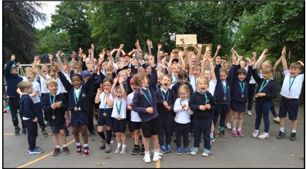
You did it! The children, who each received a medal, celebrate completing the walk

Thank you to Friends of Lewknor School (FoLS) for organising a fantastic sponsored walk fundraiser along The Ridgeway. The Upper Juniors had the longest trek and they completed their 5.6 mile route in two hours and 20 minutes. It is truly amazing that £3,500 was raised and I would like to thank all the parents who gave up their time to organise this event and the parents, grandparents, aunts, uncles and friends of Lewknor Primary who gave so generously.