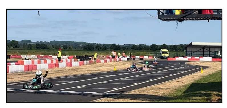
Ralph finishes first!