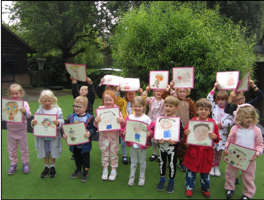
Left: Our Reception class with their portraits of their daddies