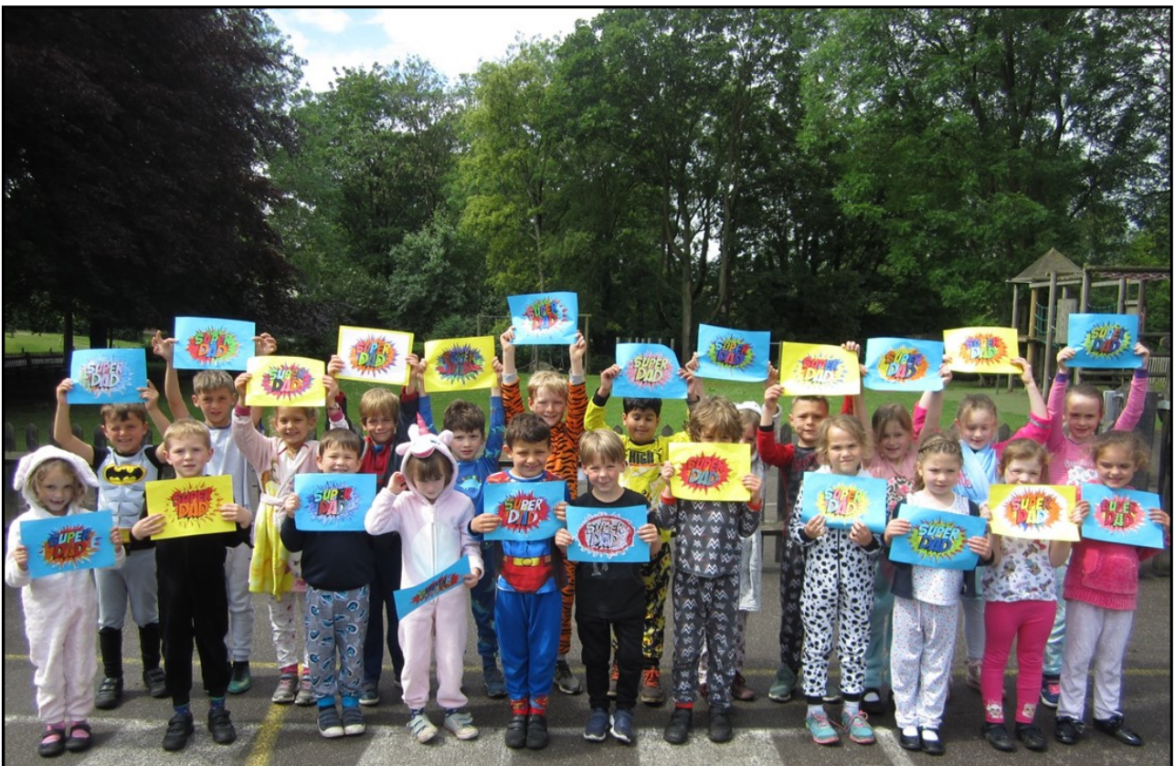
Above: Infants with their Super Dad cards