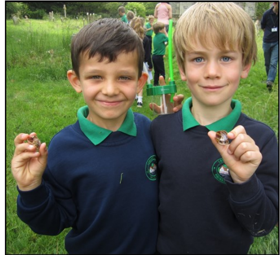
Above left: the children wander round the church grounds looking for insects