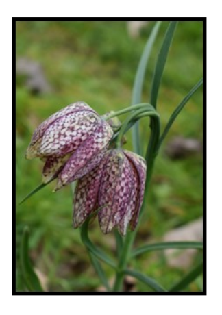
Above: Fritillary the county flower of Oxfordshire