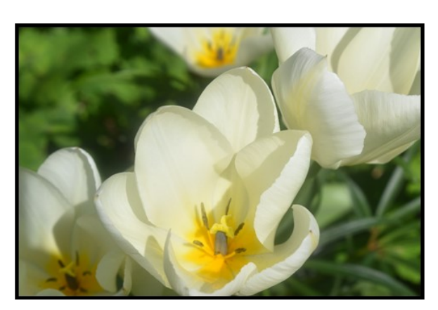
Blooming lovely - more pretty flowers

Left: Head-to-head. Two rhinoceros about to fight? Below: Lion around! The lion and lioness take things easy