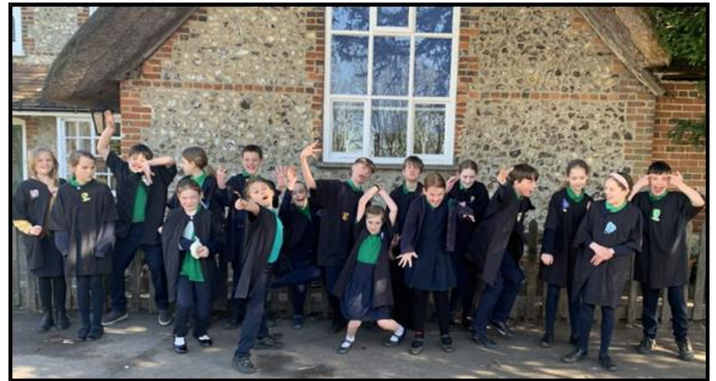
Lewknor Church of England Primary School