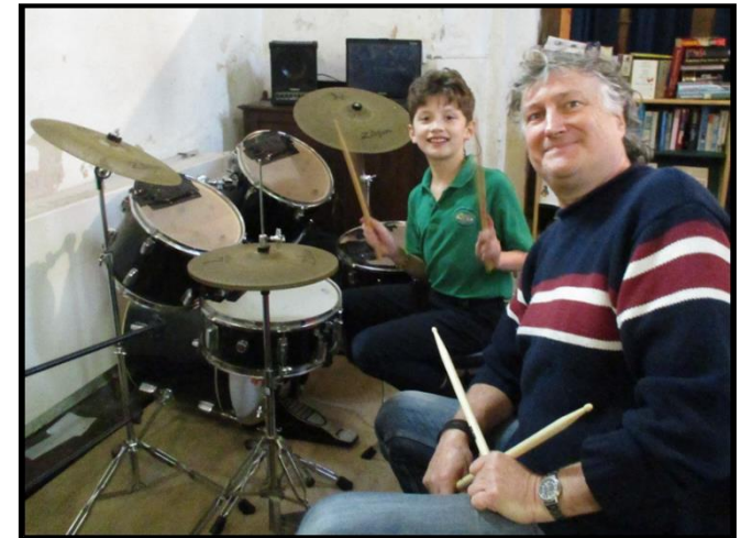
Lewknor Church of England Primary School