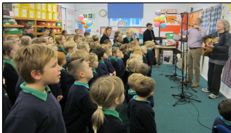
Above: The Upper Juniors classroom is turned into a recording studio