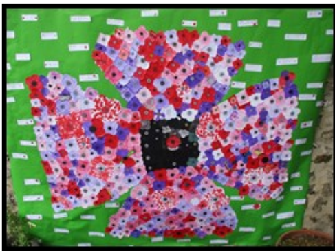
Above: all the children at school helped to make this huge and very beautiful poppy display