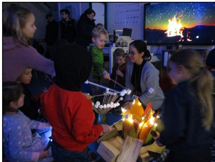
Children in the Infants class pretend to toast marshmallows round the campfire

Meanwhile over in the Infants class (Years 1 and 2), Mrs Hopkins was reading spooky stories round the campfire — see picture below. The children, some dressed in pyjamas and onesies, tucked into marshmallows and made shadow puppets for their own spooky tales.