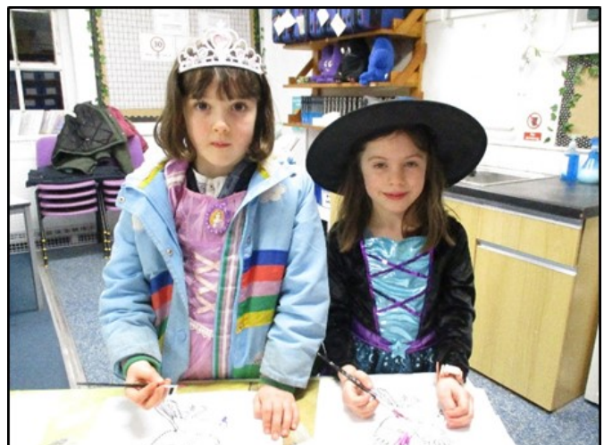
Violet and Amy draw characters from a book

Other books on display included The Invisible by Tom Percival. This is a very moving and powerful story about a young girl who feels invisible but who actually makes a difference and shows that we all belong. And lastly, Have You Filled A Bucket Today: A Guide To Daily Happiness For Kids by Carol McCloud and David Messing encourages kindness to others. It really is another beautiful read and I would recommend it to all.