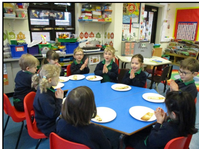
Left: the Reception class say Grace before eating