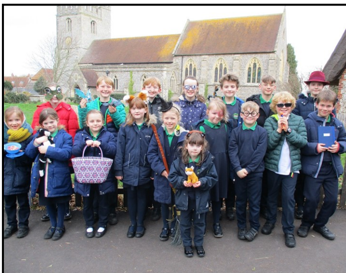
Above: Some of the children with their props

And this year it was the teachers turn to dress up! They chose to focus on the enchanting book The Boy, the Mole, the Fox and the Horse by Charlie Mackesy. I think it's easy to guess who was what!