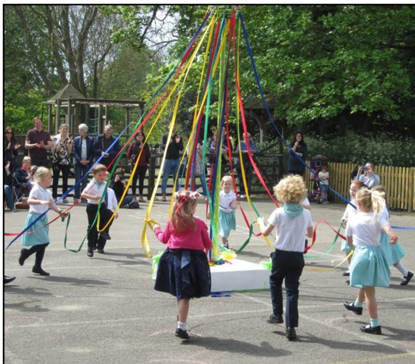
Right: The reception class dance round the maypole