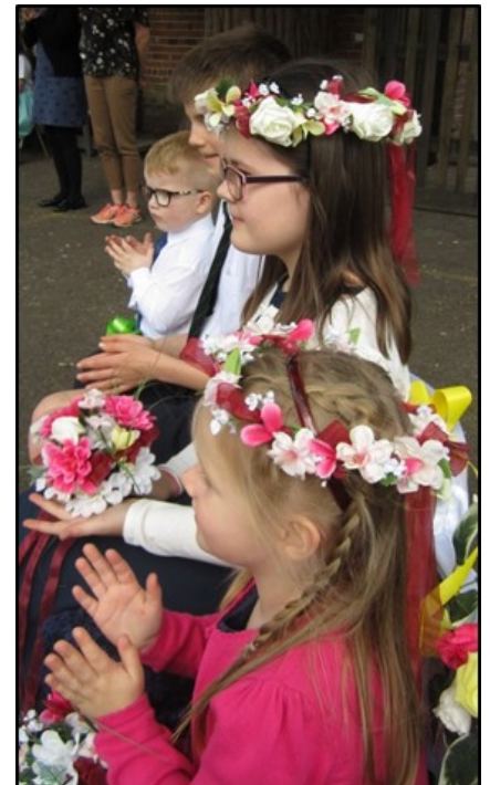
Above: The beautiful garlands for our gorgeous girls!