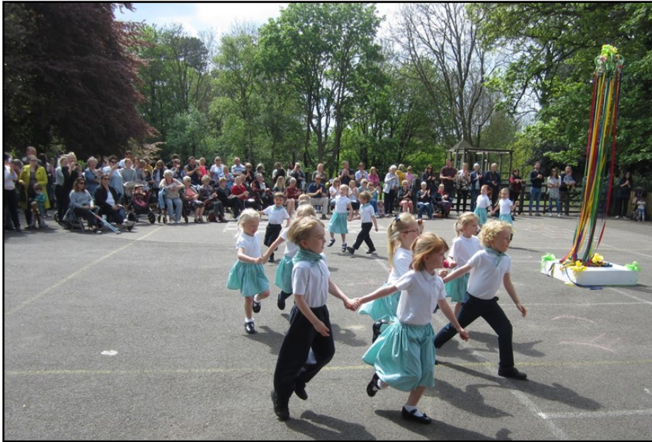
Left: The Infants skip round the maypole