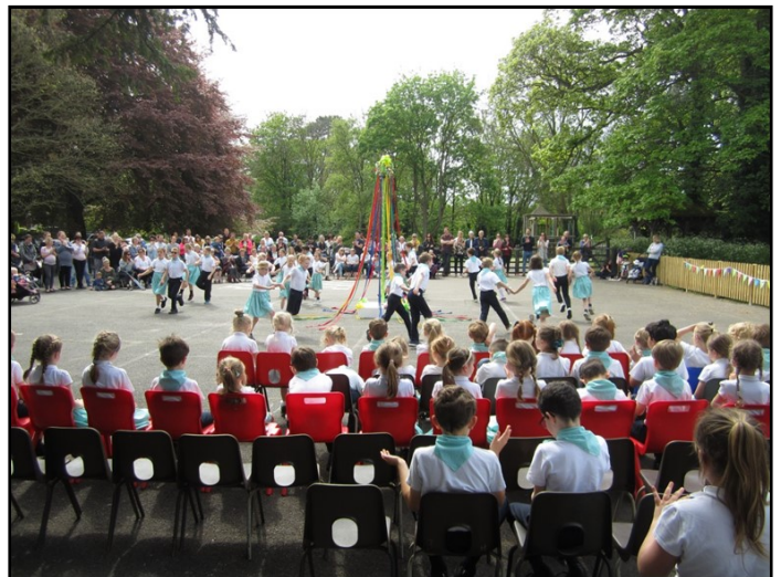
Right: May Day in the playground