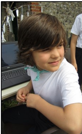
Below right: The Upper Juniors dance