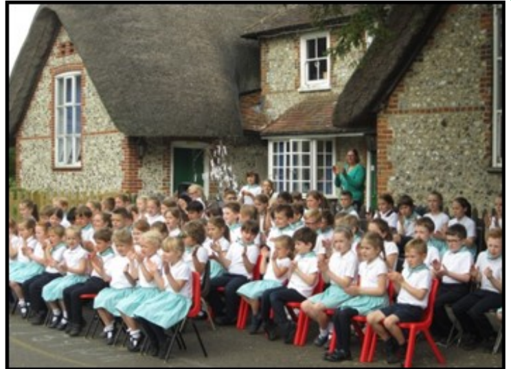
Above: Our pupils clap along to the music