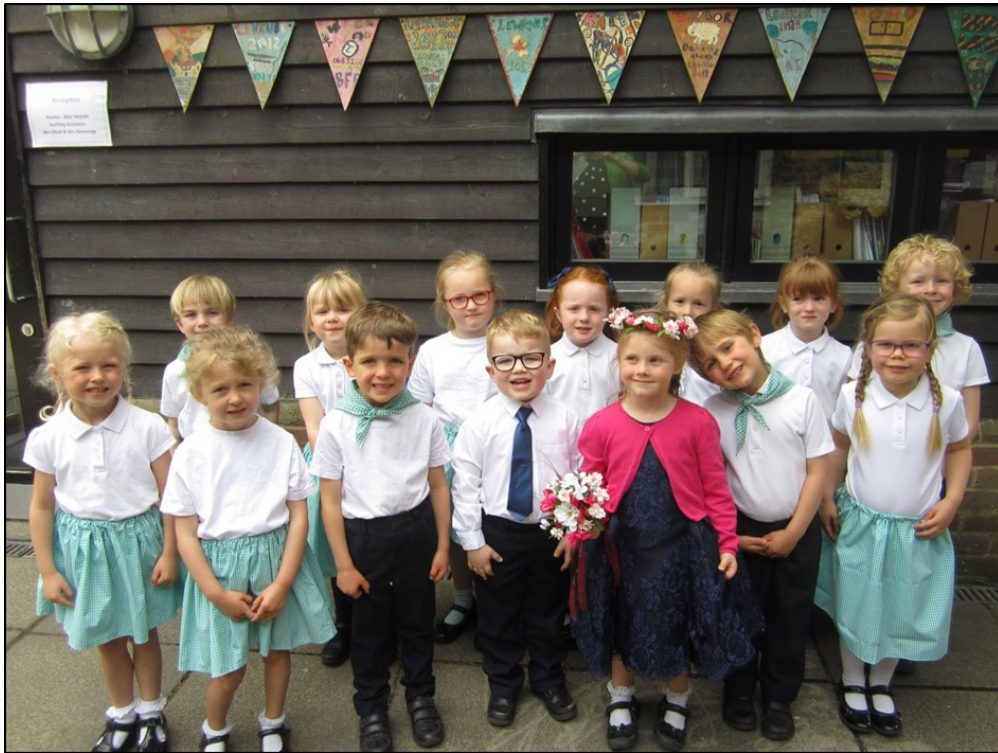
Above: Their first May Day at Lewknor Primary—the reception class