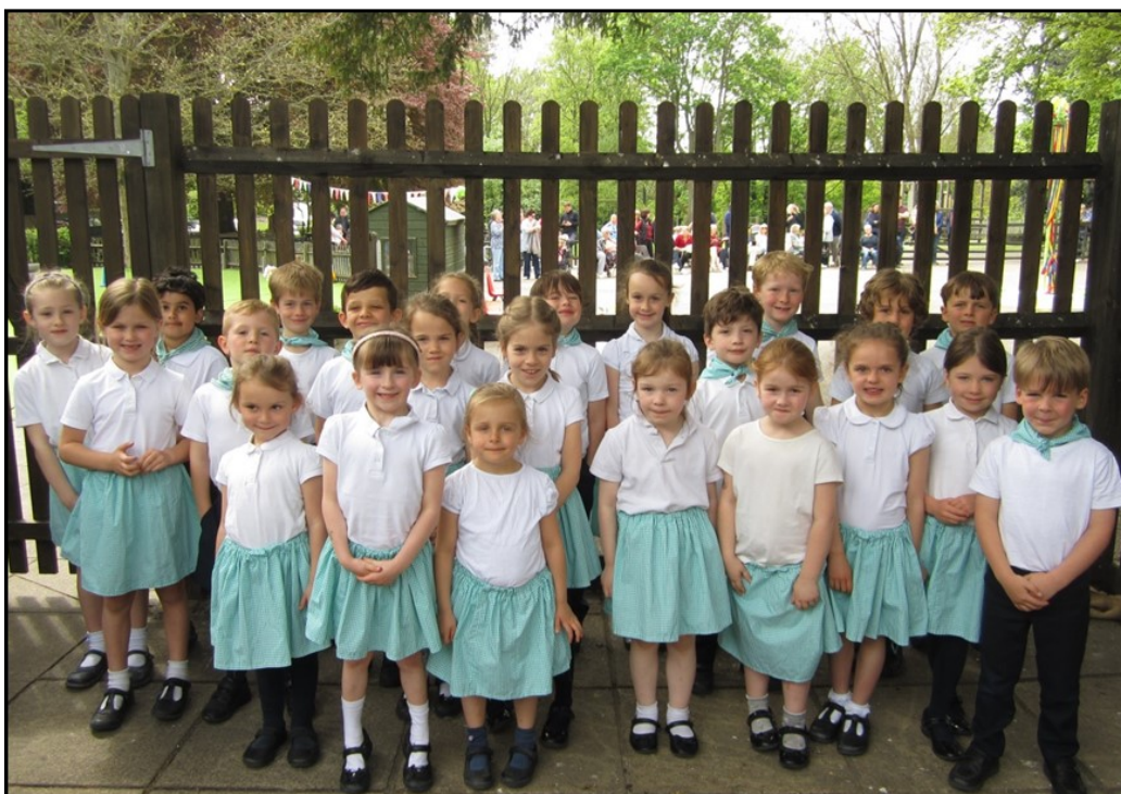
Below: Old hands at May Day—the Infants!