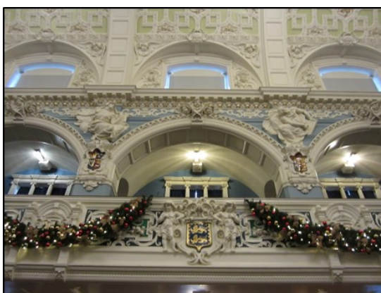
Above: the magnificent architecture in the main hall where the choir performed.

Our school choir, pictured above, did us proud when they performed at the Big Christmas Sing at Oxford Town Hall last week. This event brings together primary schools across Oxfordshire to raise funds for Christian Aid. Our children were last to perform out of all the schools and they gave a hearty rendition of Ding Dong Merrily On High. All the schools sang a number of