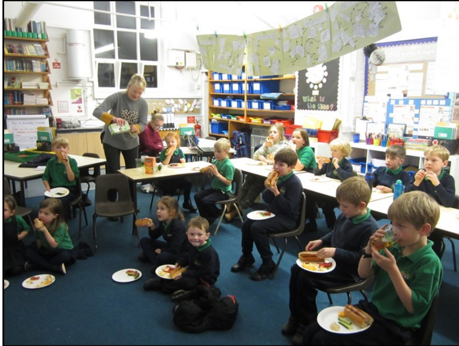
Left: Grub's up! Children tuck into a yummy hot dog meal with vegetable and fruit snacks