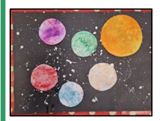
Left: the finished artwork